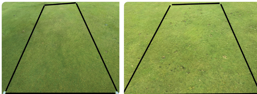
Image 1 - Example trial plots during trial showing low disease incidence (left), and high disease incidence (right) .

An independent summer disease trial was conducted at Lyon Salvagny Golf Club by Ecoumene Golf and Environment, managed by Ollivier Dours. Five product treatment combinations were trialled focussed on biostimulant and biological solutions alongside an untreated control and a fungicide programme (six applications). All treatments had a rolled (3x per week) and unrolled application, plus a high N (delivering 145-0-165, NPK) and a low N version (delivering 87-0-99, NPK) – all nutrients applied via 3x granular applications. Standard assessments were made with the key assessment for this trial of number of dollar spots per plot (2m 2 ) on a weekly basis.