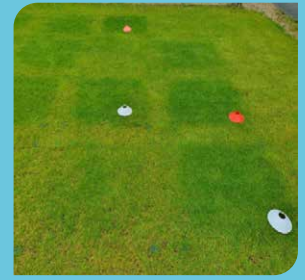
Week 7 16th March