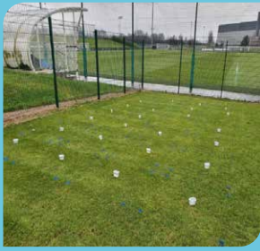
Trial Setup 1st February