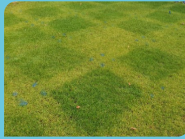
Week 4 23rd February