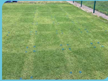
Week 2 12th February