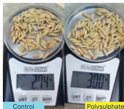
9% higher grain weight in the Polysulphate treated rice compared to the control