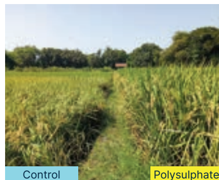
Higher rice plants in the Polysulphate plot