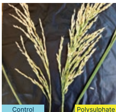
Better grain filling and stronger panicles with Polysulphate